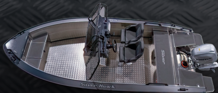
Silver Hawk SCX